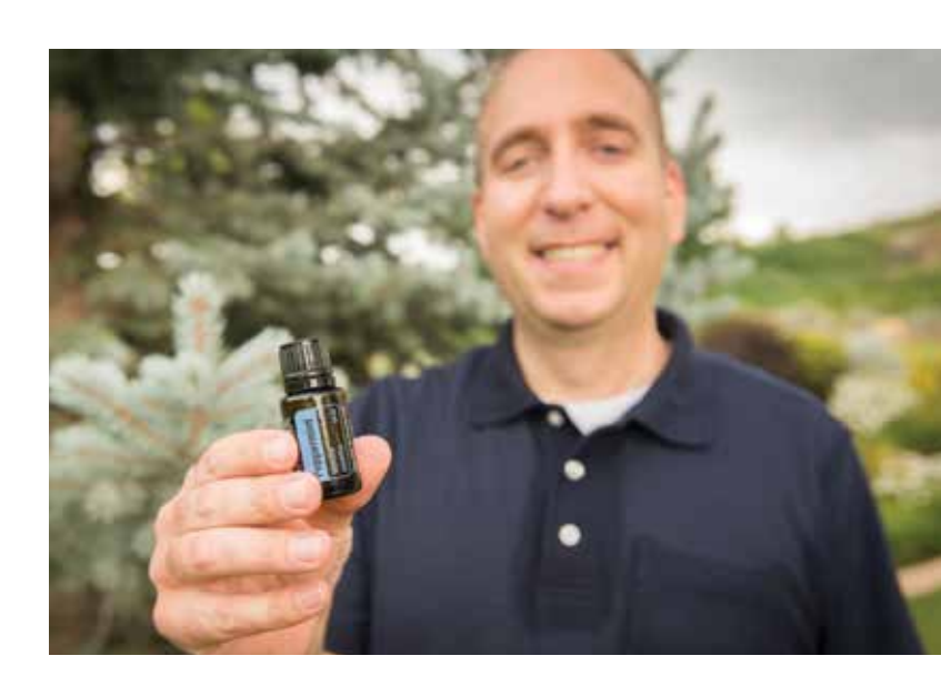
Beginners Trio Kit- Item No. 32140001

Every spring, I experience seasonal discomfort. This year, I learned that the Lemon-Lavender-Peppermint trio can be used as a natural soothing agent. When I feel the need, I add two drops of each oil to eight ounces of water, and let the blend do its magic. I can honestly say this has been a fantastic year for me. I am very grateful to have safe alternative choices in my family's health care. I would encourage anyone to experience the amazing benefits of doTERRA.