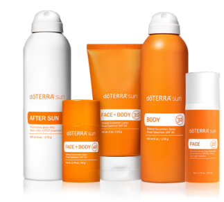
dōTERRA® sun Protect your body and skin with moisturizing and effiective products free of harsh ingredients.

Use dōTERRA On Guard<sup>®</sup> Natural Whitening Toothpaste or dōTERRA SuperMint<sup>™</sup> Toothpaste and Mouthwash or dōTERRA morning and night to naturally brighten your smile.