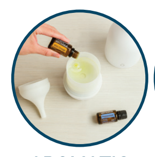
AROMATIC Breathe in directly or use diffuser