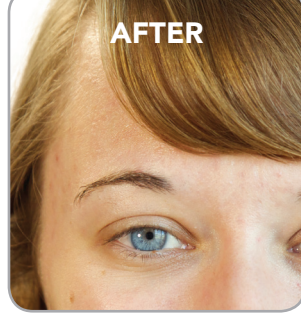
After just 3 weeks