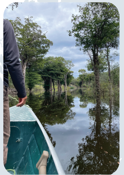
Copaiba Harvesting in Brazil

In 2019, the Healing Hands Foundation funded a dental clinic for