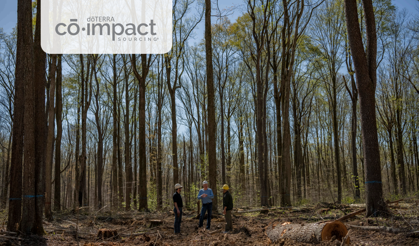
Forest in Pennsylvania where birch trees grow abundantly.

Birch essential oil has been used traditionally for many generations , typically only available in small volumes due to the complexity of raw material preparation and distillation. Over a decade ago, dōTERRA sourced a small supply of Birch essential oil from the Northeastern United States. Eventually, dōTERRA outgrew this supplier's production, and Birch oil, temporarily, became a thing of the past. That's when dōTERRA began the pursuit to produce our own Birch oil in sufficient volumes, meeting stringent CPTC® standards.