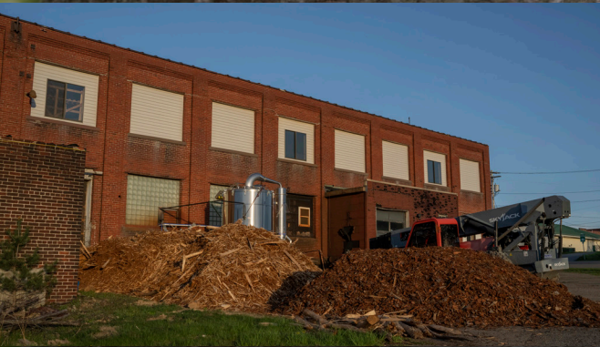
doTERRA's essential oil distillery, Woodside Oils, in Kane, Pennsylvania