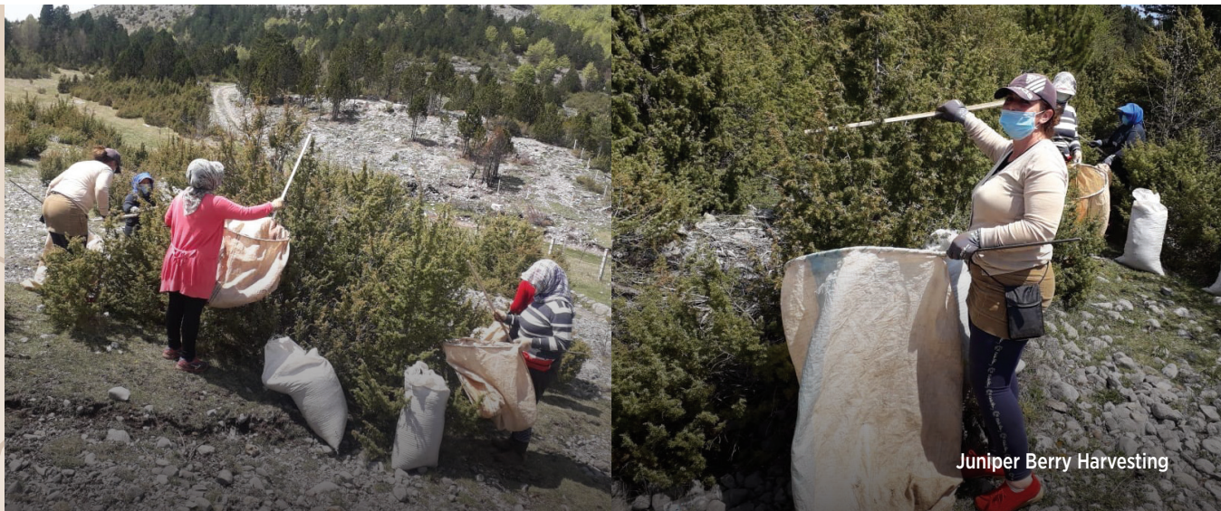
Juniper Berry Harvesting

The dōTERRA Healing Hands Foundation has supported several projects in the communities of essential oil farmers in Albania. Projects are selected based on the needs and requests of sourcing communities, or communities in which farmers and their families live. Leaders in sourcing communities identify the projects, which are then reviewed, approved, and funded by dōTERRA Healing Hands.