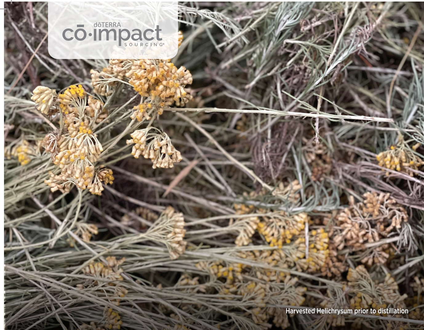
Harvested Helichrysum prior to distillation