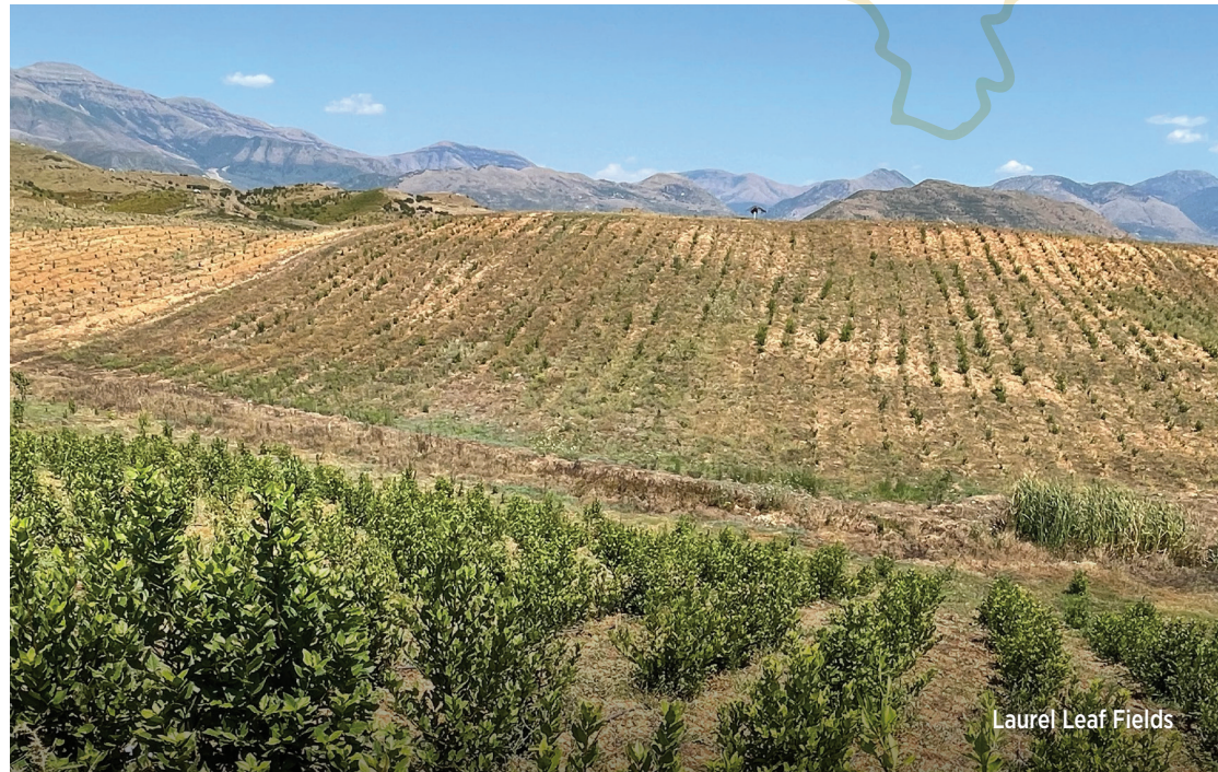
Laurel Leaf Fields