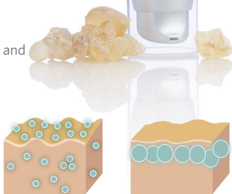
When using Hyaluronic Acid Particles