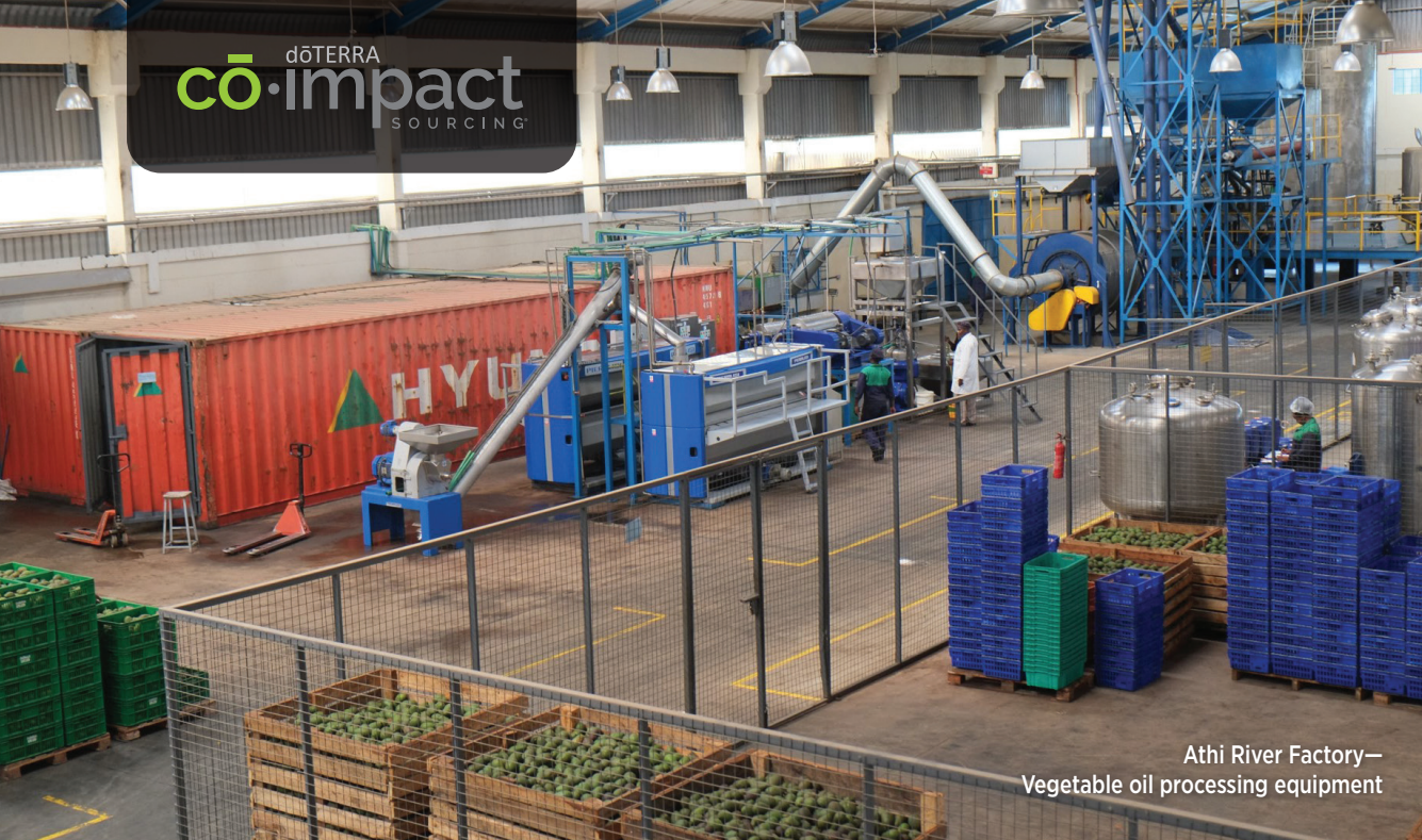
Athi River Factory— Vegetable oil processing equipment