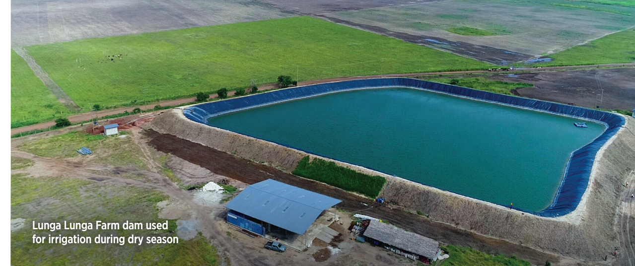
Lunga Lunga Farm dam used for irrigation during dry season

commercial farm, with field officers working closely with smallholder farmers to ensure quality, improve yields, and maximize incomes for their crops.