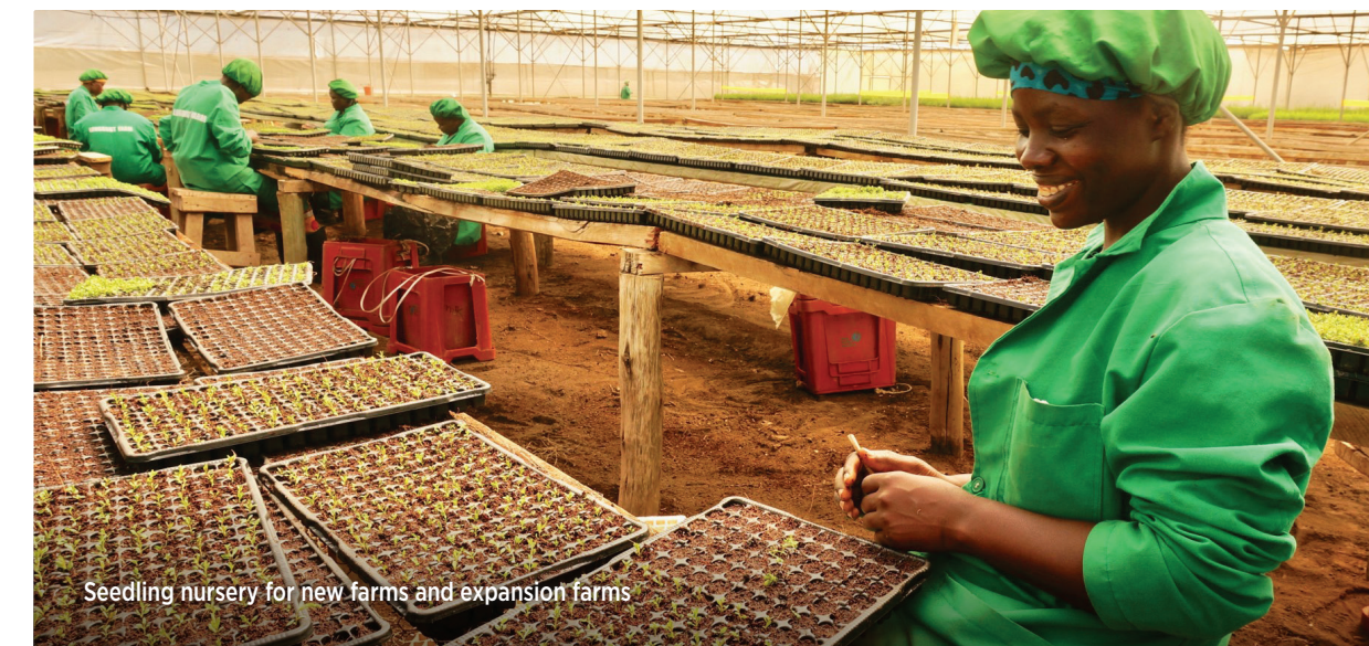
Seedling nursery for new farms and expansion farms

In addition to the production of essential oils, Fairoils is a large producer of pure and natural vegetable oils for the cosmetic and personal care industry. They produce an extensive list of vegetable oils including Sesame, Avocado, Macadamia Nut, Tamanu, Pomegranate Seed, Moringa, Shea, and Baobab. The plants are grown and harvested by smallholder farmers from all over Kenya, Uganda, Madagascar, and Sudan, and are brought to the Athi River Facility where the seeds (or nuts) are pressed, blended, and then exported to customers in the cosmetics industry. dōTERRA intends to utilize many of these exciting carrier oils in future products.