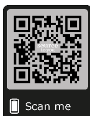
Source to you 追本溯源

***** 我們誠邀您登入 Source to you 追本溯源 網站，深入了解 dōTERRA 精油從產地、品種、栽種、耕作、採收、萃取到成品的嚴格監控程序。您亦可以在網站內的 品質報告(GCMS) 版面，輸入您獨特的品質辨識碼（Quality ID）來瀏覽獨立經認證的第三方實驗室所做的測試結果。