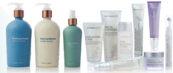
Hair & Skin