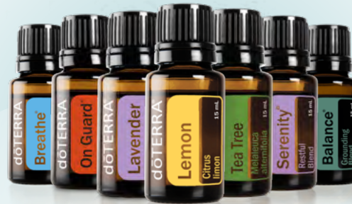
CPTG Essential Oils