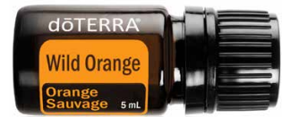
Wild Orange | 5 mL Aroma: bright, citrusy, sweet