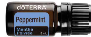
Peppermint | 5 mL Aroma: minty, fresh, cooling