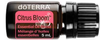
Citrus Bloom™ | 5 mL Aroma: sweet, floral, tangy