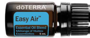
Easy Air® | 5 mL Aroma: invigorating, clear, revitalizing