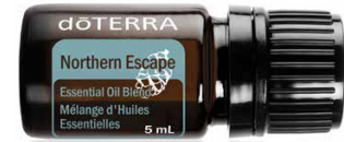
Northern Escape | 5 mL Aroma: crisp, soothing, piney