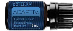
Adaptiv™ | 5 mL Aroma: centering, sweet, balanced