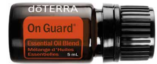
On Guard® | 5 mL Aroma: warm, spiced, fortifying