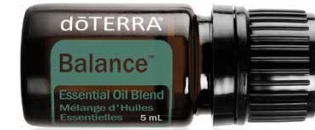
Balance® | 5 mL Aroma: grounding, meditative, tranquil