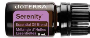
dōTERRA Serenity® | 5 mL Aroma: calm, soothing, gentle