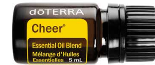
dōTERRA Cheer® | 5 mL Aroma: bright, spiced, uplifting