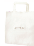
Loyalty Rewards order