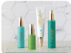
Skin & Spa