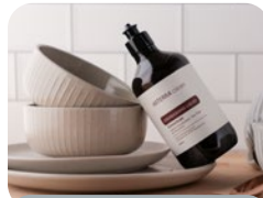
Low Tox Living