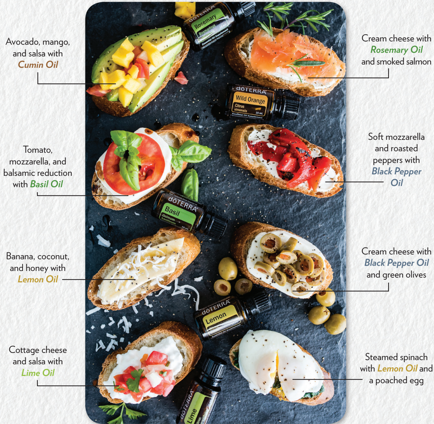
Avocado, mango, and salsa with Cumin Oil

Serve these quick and easy bruschetta spreads at your next summer brunch, or make it a fresh and light snack on those hot summer days.