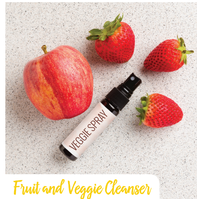
Fruit and Veggie Cleanser

Preheat oven to 350° F. In a large bowl, cream 1 cup cold butter and 2 cups sugar for 4 minutes until light and fluffy. Add 2 eggs, 1 teaspoon vanilla, 1½ tablespoons fresh lemon juice, and 1-2 drops Lemon oil. Stir to combine. Stir in 3 cups flour, 1¼ teaspoons baking powder, ¼ teaspoon baking soda, and ½ teaspoon salt. Mix until just combined. Drop dough onto parchment paper covered baking sheet. Bake for 9-11 minutes. Allow to cool. Sprinkle with sugar or frost with Lemon Buttercream.