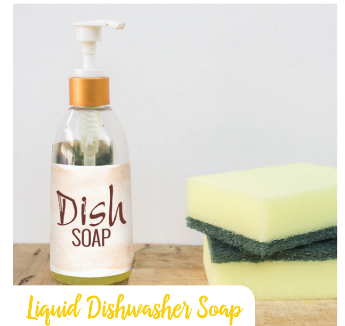
Liquid Dishwasher Soap

TIP: Use empty dōTERRA spray bottles to store your homemade fruit and veggie spray.