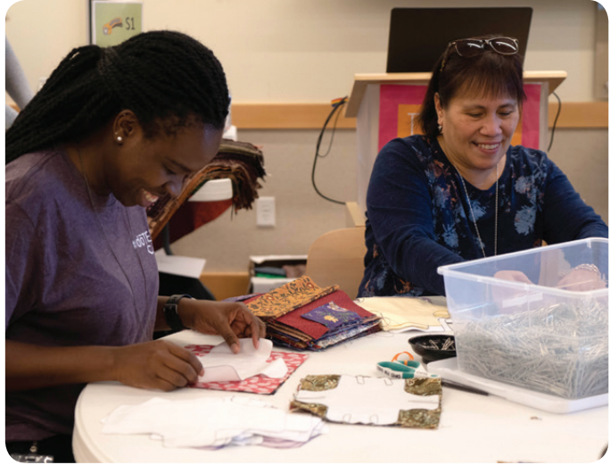
Day of Change—Volunteers assemble feminine hygiene kits