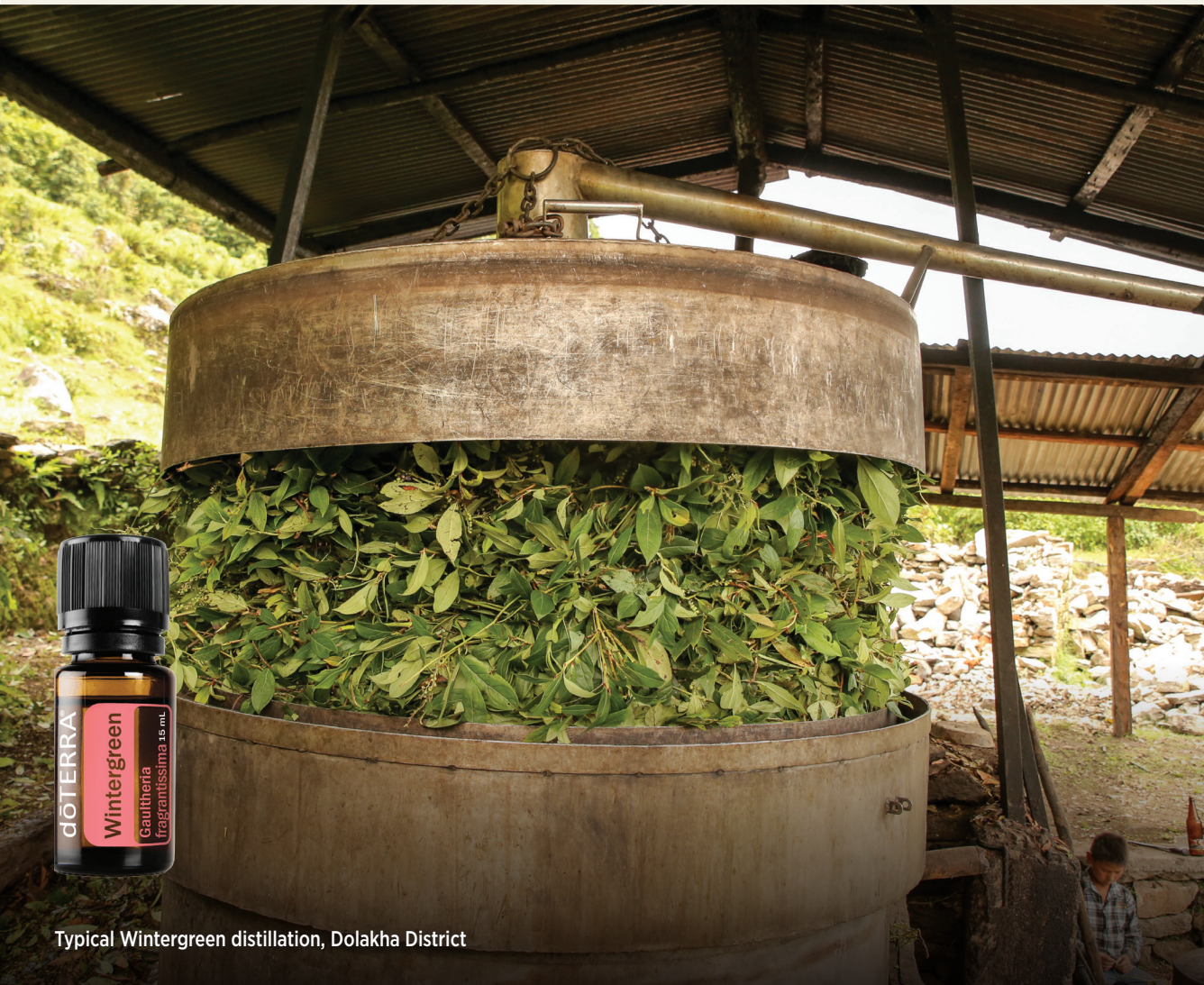
Typical Wintergreen distillation, Dolakha District

These supply chain improvement initiatives help to ensure that harvesters and distillers make a fair wage and optimize oil yields to make best use of these important natural resources.