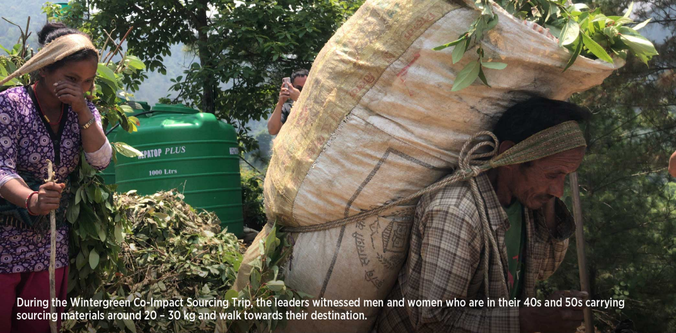
During the Wintergreen Co-Impact Sourcing Trip, the leaders witnessed men and women who are in their 40s and 50s carrying sourcing materials around 20 – 30 kg and walk towards their destination.