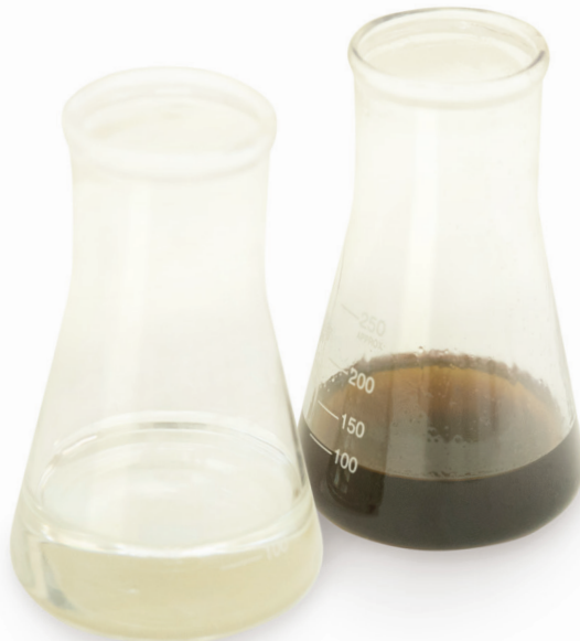
Copaiba Oleoresin as harvested from the trees

well as the challenge of providing technical support and other services to rural areas. Fortunately, dōTERRA is uniquely equipped to help in some parts of Brazil.