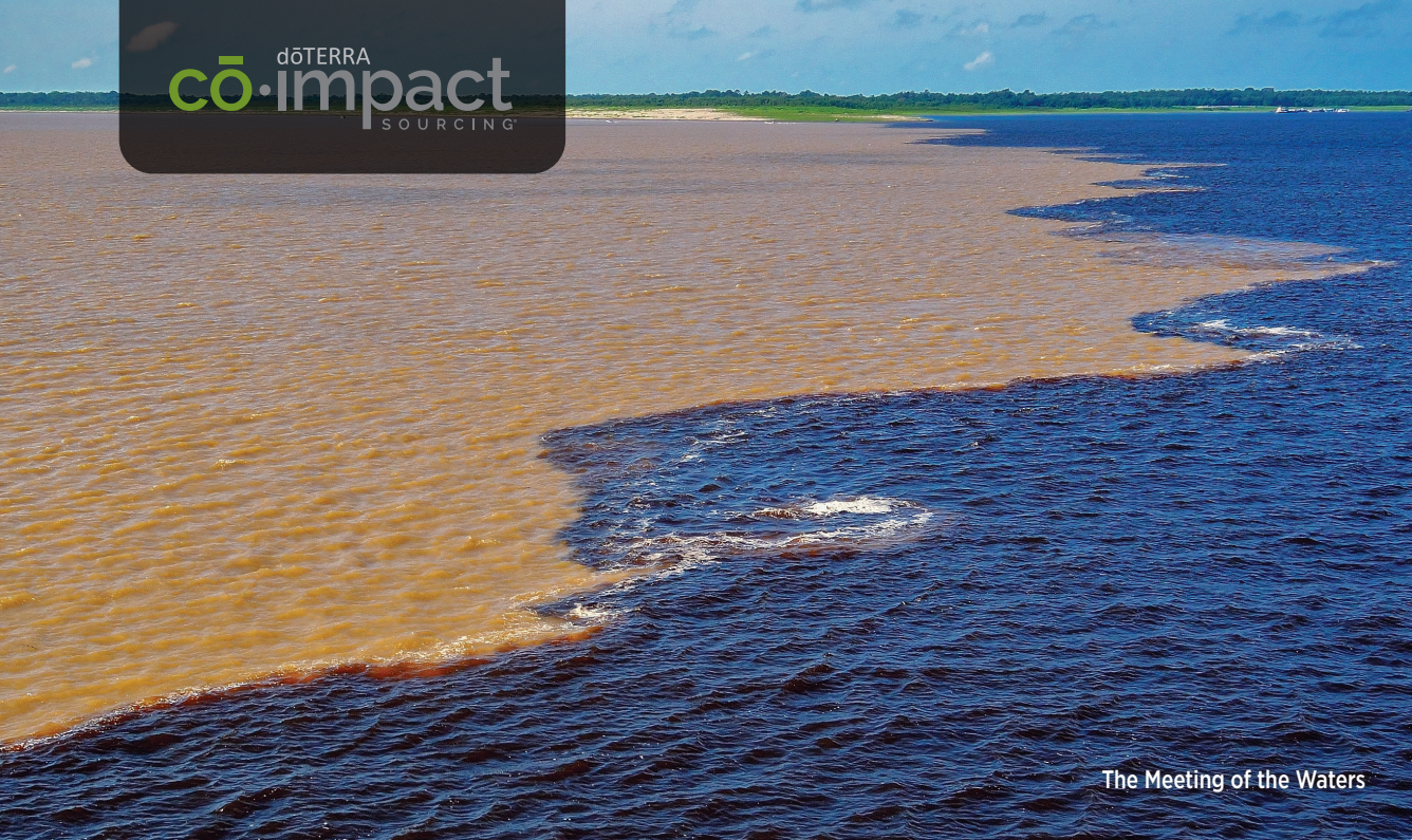
The Meeting of the Waters