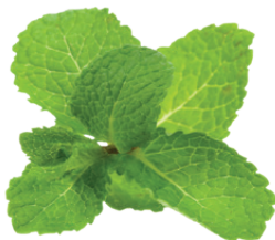
3 lbs. Peppermint

Essential oils are extracted from different parts of a plant and are more powerful than herbs.