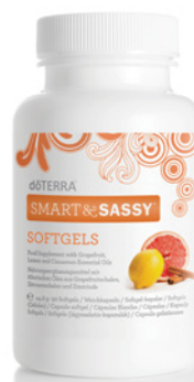
SMART & SASSY™ SOFTGELS 90 vegetarian softgels

Smart & Sassy Softgels contain the proprietary Smart & Sassy essential oil blend in convenient softgels to promote weight management. The flavourful blend of Smart & Sassy contains essential oils to support a healthy lifestyle and promote a positive mood.