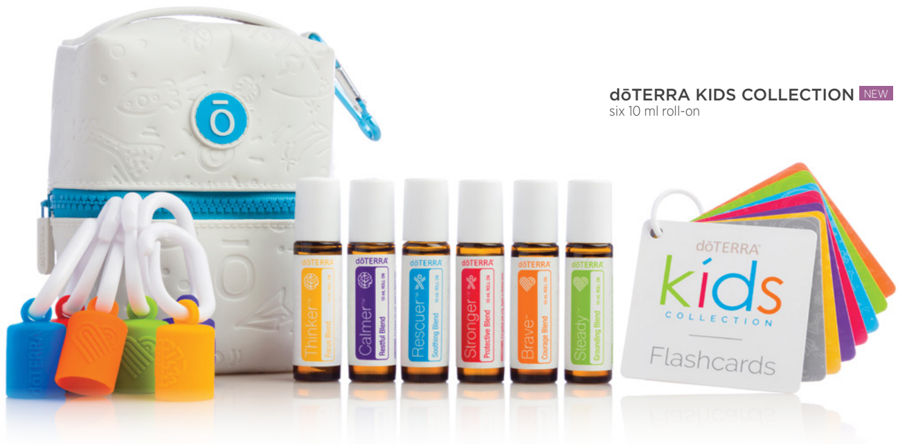
dōTERRA KIDS COLLECTION NEW six 10 ml roll-on

Whether you are an experienced practitioner or new to essential oils, the dōTERRA Kids Collection is the complete and ready-made “whole body” essential oil toolbox designed to confidently care for the health and wellness of little ones. Formulated specifically for developing minds, bodies, and emotions, these essential oil blends feature unique combinations to provide powerful benefits while being gentle on delicate skin.